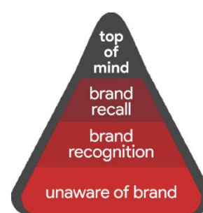
Figure 2: Brand Awareness Pyramid

Figure 2 explains the authors use the Brand Awareness level, to find out how much the level of public awareness of the Transport Management Study Program is by the targets to achieve, as well as the position of this research Program in the Brand Awareness pyramid.